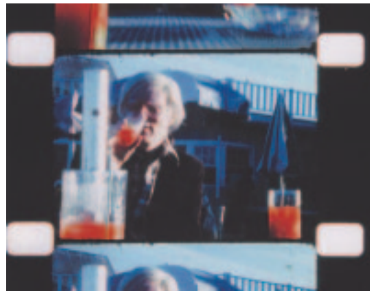
Jonas Mekas, Andy Warhol in 'Scenes from the life of Andy Warhol', 1990