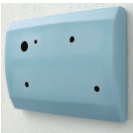
Bevan Honey, Flag VIII , 2006, Plywood, Masonite, Polymer Resin, Automotive Acrylic

Since its launch in 1999, the Faculty Gallery has become a significant feature of Monash Art & Design.