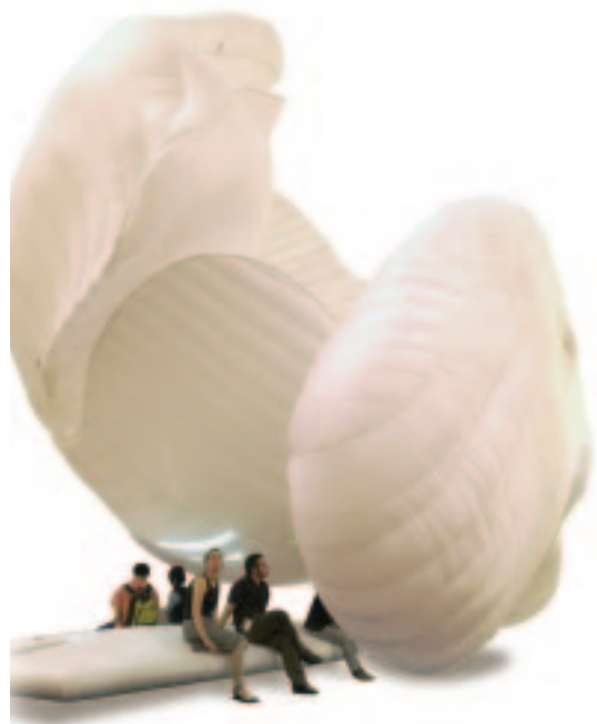
Dark Matter, installation detail, 2006